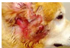
Hot spot on a dog's face